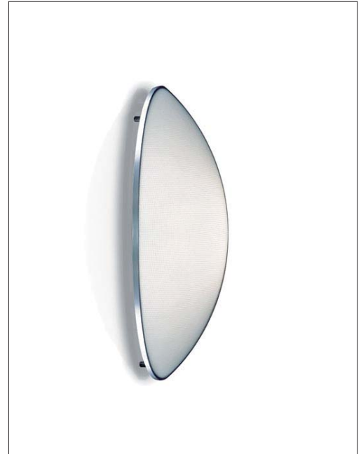
D14 a. - D14 a.fe

Reference code: D14 a. 1D14A0000020 alu D14 a.fe. 1D14AFL00020 alu D14 a.pi. 1D14A1PI0020 alu D14 a.pi.fe. 1D14A1PFL020 alu